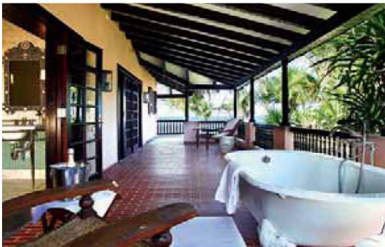
Clockwise from above: the verandah and private infinity pool of the Ocean Sanctuary Suite at the Ritz Carlton Dorado Beach; the colourful façades of a typical San Juan street; Plantation House at the St Regis Bahia Beach; a shaded balcony of Su Casa, the Ritz Carlton's hacienda, with outside bath